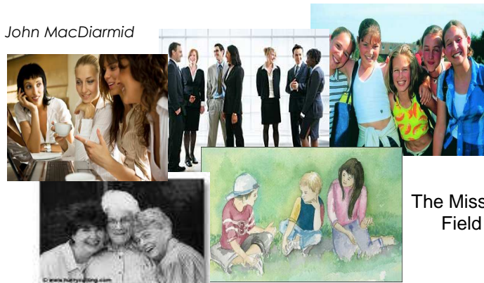
The Mission Field